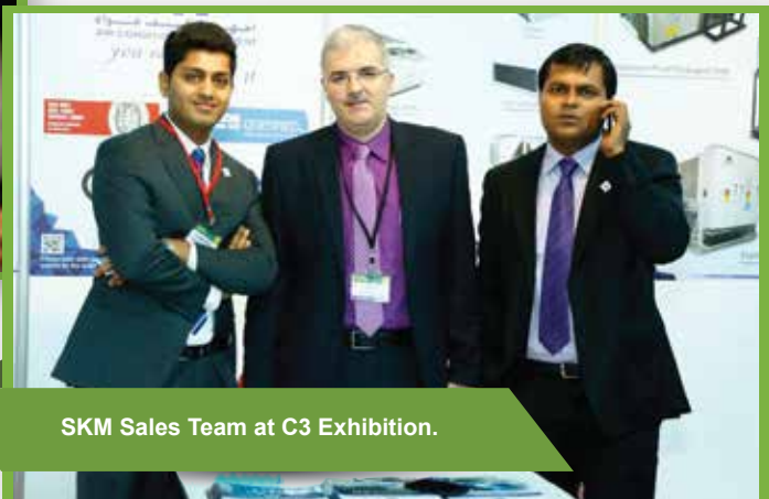
SKM Sales Team at C3 Exhibition.