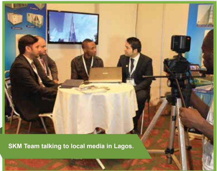
SKM Team talking to local media in Lagos.