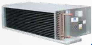
Fan Coil Units