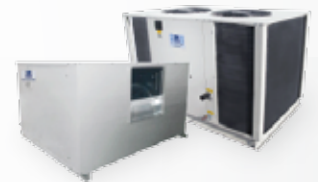
Ducted Split Units

Celebrating over 40 years of excellence, SKM Air Conditioning is a premier name in the air conditioning industry and one of the leading manufacturers of HVAC equipment. SKM offers superior quality HVAC products that are certified by globally recognized bodies like Eurovent, AHRI, TÜV and UL. It has provided solutions for many prestigious projects across the region, justifying the slogan “you name it.. we cool it”