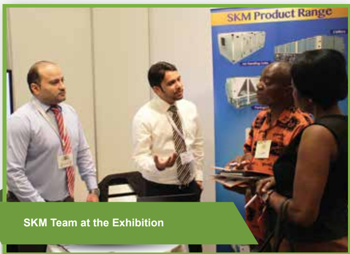
SKM Team at the Exhibition

SKM participated in Buildmacex 2015 held at Eko Convention Center in Lagos from 3rd to 5th February 2015.