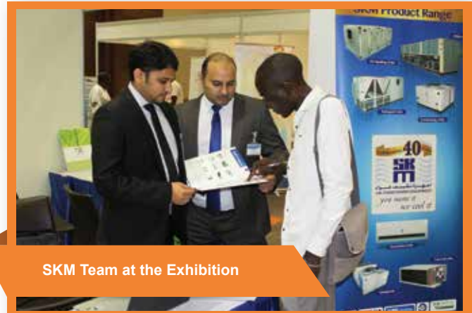
SKM Team at the Exhibition