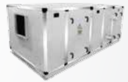
Air Handling Units