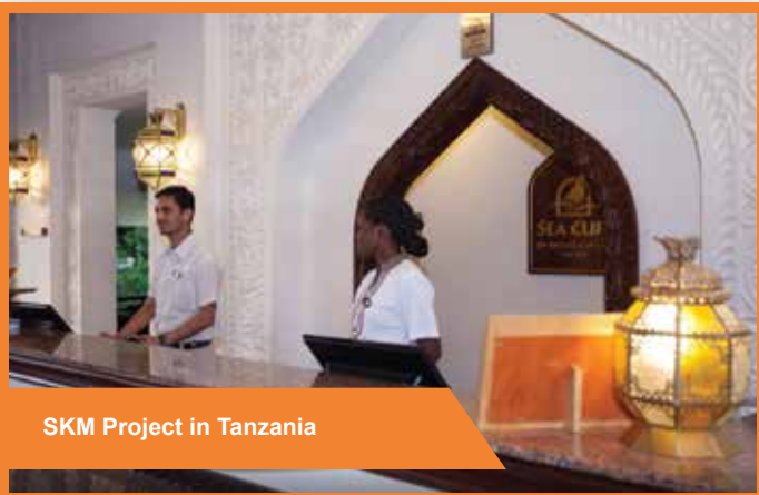
SKM Project in Tanzania

Buildex 2015 attracts visitors from all over East & Central Africa while exhibitors participate from over 20 countries. Visitors from the African countries include Kenya, Sudan, Ethiopia, Mozambique & Zaire, Nigeria, Egypt & South Africa.